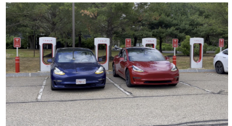
Dueling Model 3 Teslas