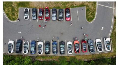
Drone image - Teslas in the car park - Mt. Wachusett

https://www.facebook.com/groups/711718265626085/user/100003086039233