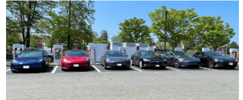
N. Dartmouth Charge and Chat