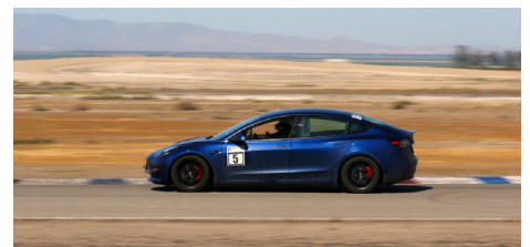
Bev on the track at Teslacorsa