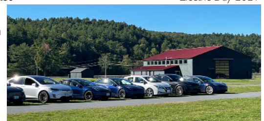
Electric Day 2021

September 25th, 2022 , 08:00 - 17:00 hrs. at Canaan Motor Club NH. A day of educational, high-performance driving with a focus on safety and fun on a legal road course for electric vehicles only! There are L2 chargers on site with DC fast chargers nearby! This track day is open to all including novices in regular street cars. Registered drivers will have plenty of time to recharge with two 3hr open track sessions for 6 hours of available seat time. Video from the first ever East Coast EV-only event at Canaan Motorsports in 2021 can be seen here: https://www.facebook.com/1369800121/videos/809245633292699/ For more information and registration: https://www.motorsportreg.com/events/masstuning-trackfest-sep-25-2022-