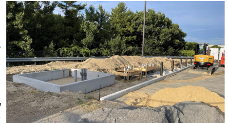
The Gloucester supercharger is under construction

In construction news, the Burlington and Tyngsborough, MA superchargers are nearly done, just waiting on utility hookups, and should be open very soon. After several years of delay, the Gloucester, MA supercharger is finally underway with completion expected before the end of summer. A West Lebanon, NH expansion has just begun, adding 8 new v3 stalls to increase capacity and cover peak holiday demand along the I-89 corridor. To reduce cost and construction time, Tesla has started to use new prefabricated supercharger systems in some projects. These pre-assembled systems comprised of a concrete pad, four charging stalls and the supercharger cabinet. These are delivered to the site on a flatbed trailer, dropped in place and then wired to the transformer. Some sites have been built in less than two weeks using this new technique! Richmond, RI is believed to be one of the first in our region, with Hanover, MA using two prefabricated units combined with four traditionally built stalls, being the second.