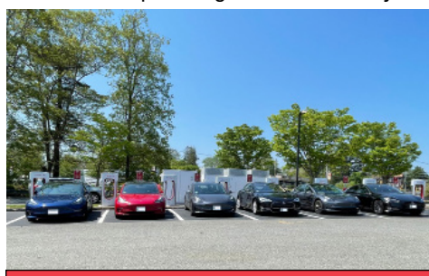
Dartmouth Superchargers, Tesla Convoy, view from the Bayside Restaurant