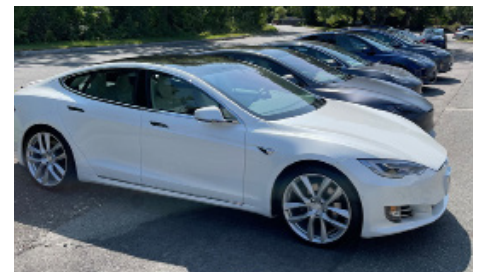
TOCNE members parked outside and inside the shop