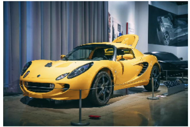
002 LOTUS ELISE "MULE 1"

https://www.petersen.org/blog/2002-lotus-elise-mule-1